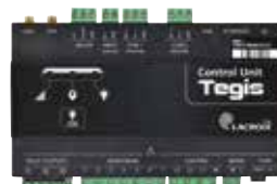
Tegis Astro control unit (see p. 50-51)