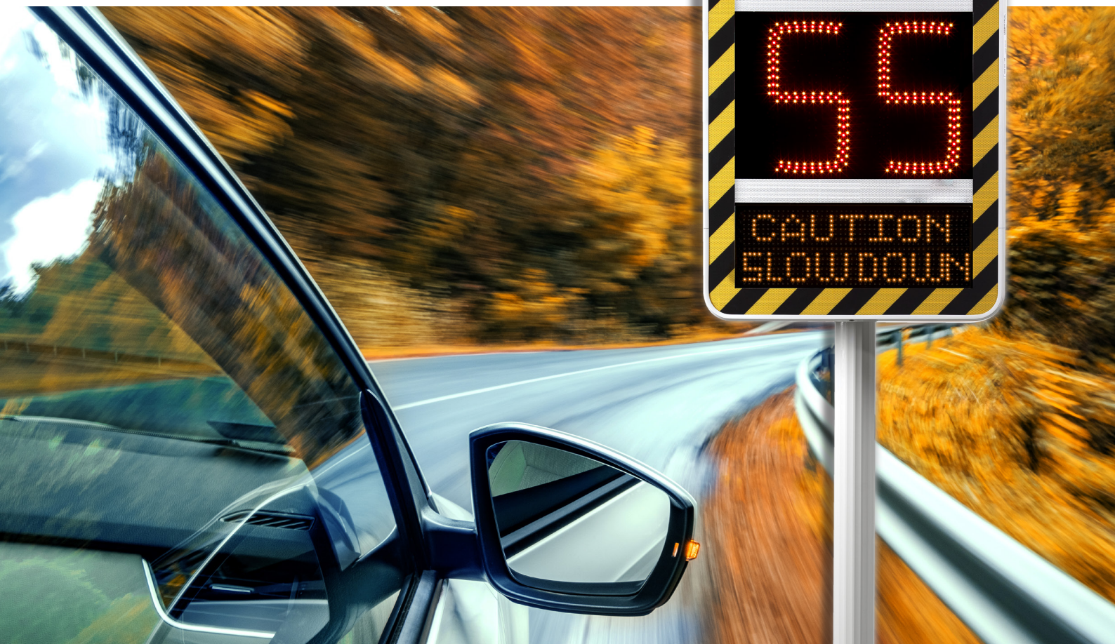
CONNECTED RADAR SPEED SIGN