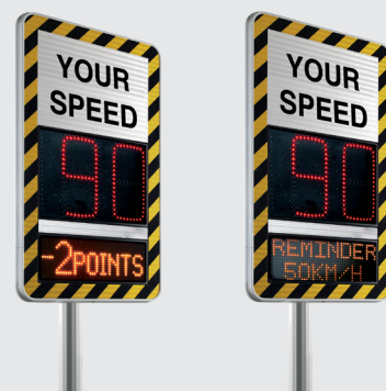
Examples of potential installation configurations

AN EFFECTIVE SOLUTION TO REDUCE SPEEDING!