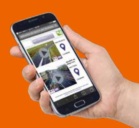
Quickly qualify information and traffic conditions for optimized mobilization of intervention teams.